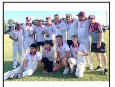
District Division Premiers: Upper Beaconsfield