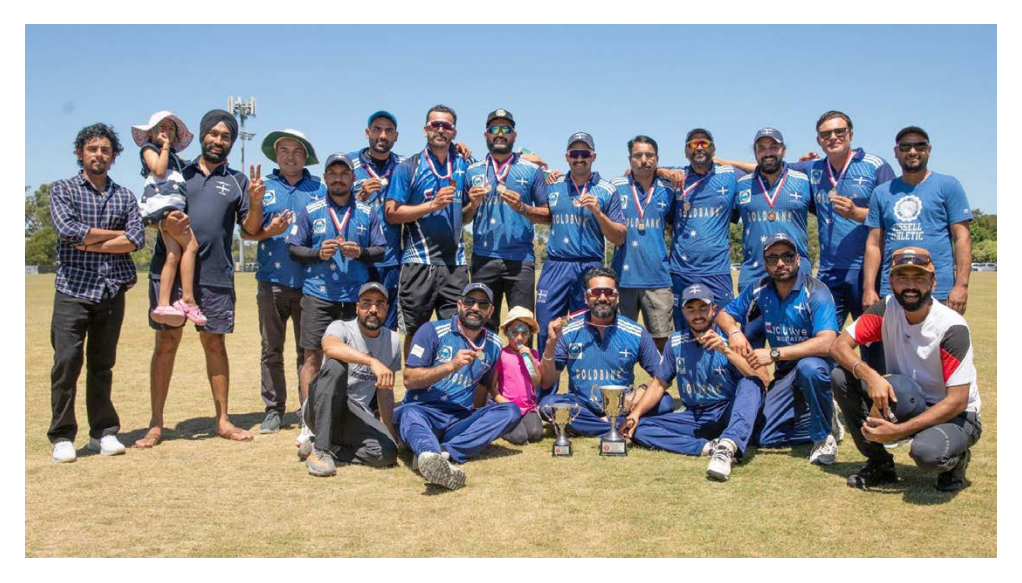
District Division: Cranbourne Meadows