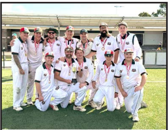
A Grade Premiers: Tooradin