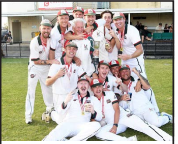
Premier Division Premiers: Tooradin