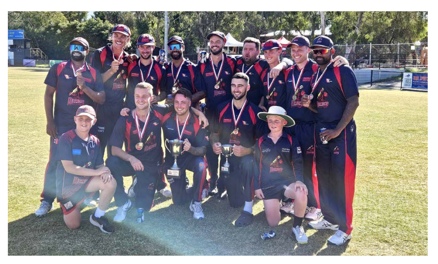
Premier Division: Koo Wee Rup