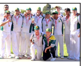
C Grade Premiers: Officer