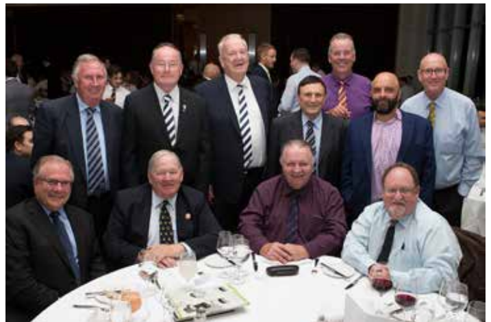
Members of our Umpires' Association.