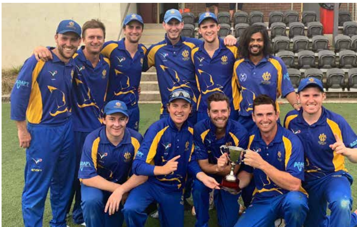
Williamstown winners of the Memorabilia Warehouse T20 Premiership.