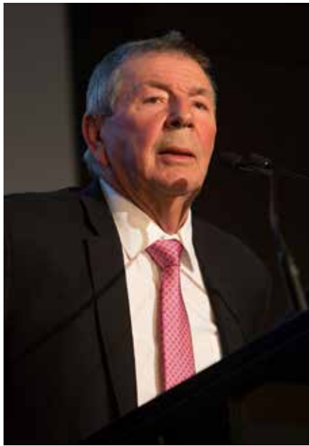
Guest Speaker former Australian Player & Chairman of Selectors; Rod Marsh.