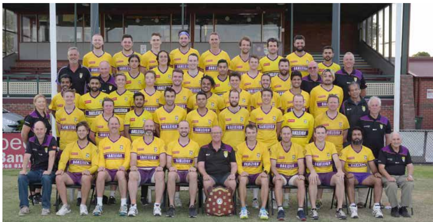
Oakleigh Cricket Club winners of the K G Fewster Club Championship.