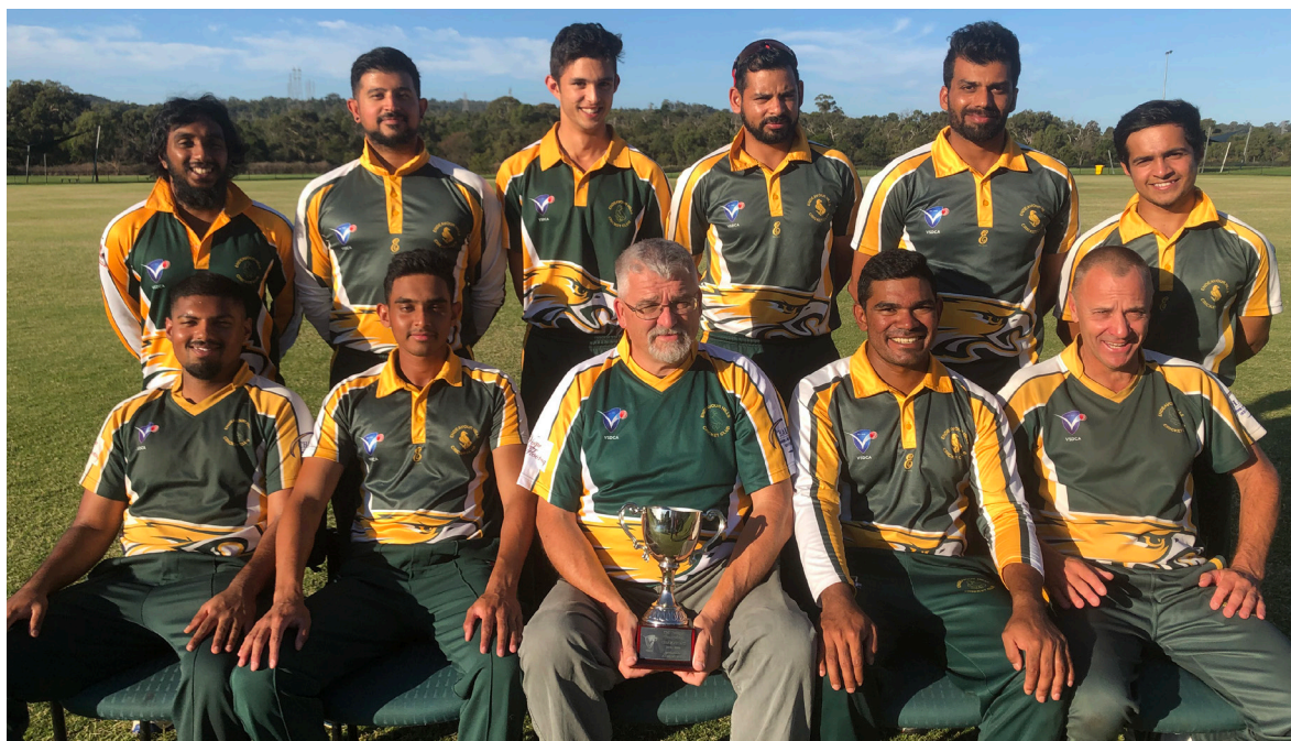
Endeavour Hills winners of the Icon Sports T20 Premiership.

Thanks to all the players and umpires who participated throughout the competition, and to our sponsor Icon Sports and to Hoppers Crossing Cricket Club for their excellent hosting of both the Semi-Finals and Grand Final.