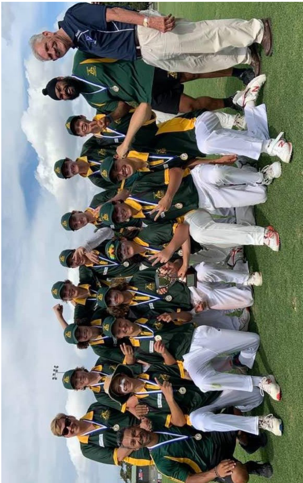
Bayswater Cricket JG Craig Under 15 Premiers.c