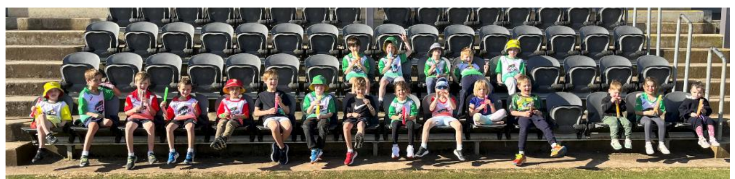
Junior Blasters enjoying a Zooper Dooper after their last session for 2022. Look forward to seeing them in 2023.

We would like to include a junior picture of the week!