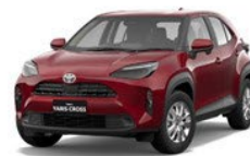
3 RD PRIZE | 2024 Yaris Cross GX 2WD 1.5L, Hybrid Auto CVT Hatch