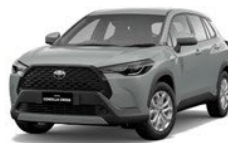
2 ND PRIZE | 2024 Corolla Cross Hybrid GX 2WD 2.0L, Auto Hatch