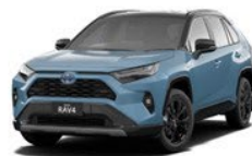
1 ST PRIZE | 2024 RAV4 XSE Hybrid 2WD 2.5L, Auto CVT Wagon